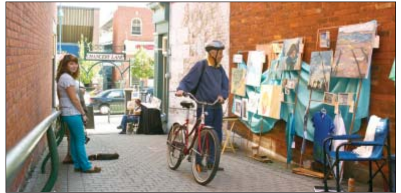
IT'S BACK: The successful Art in the Heart event which ran for two weekends last summer in downtown Bracebridge has expanded to seven weekends this summer.