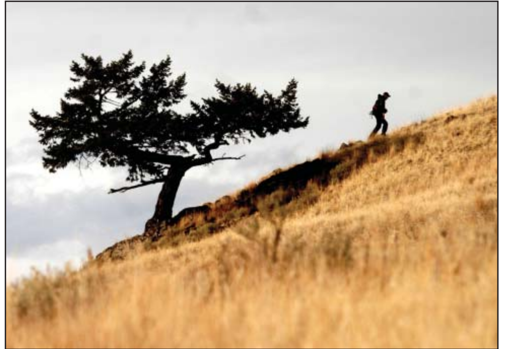
STEADY CLIMB. A man hiking up a steep slope, passing a juniper tree, in British Columbia's grasslands is one of the pieces featured in Six Degrees Muskoka's final themed art show Second Chances , running Sept. 3-15 in downtown Bracebridge. The photograph, titled Steady Climb , was taken by Karen Longwell.

For more on Six Degrees Muskoka, visit to www.sixdegreesmuskoka.com .