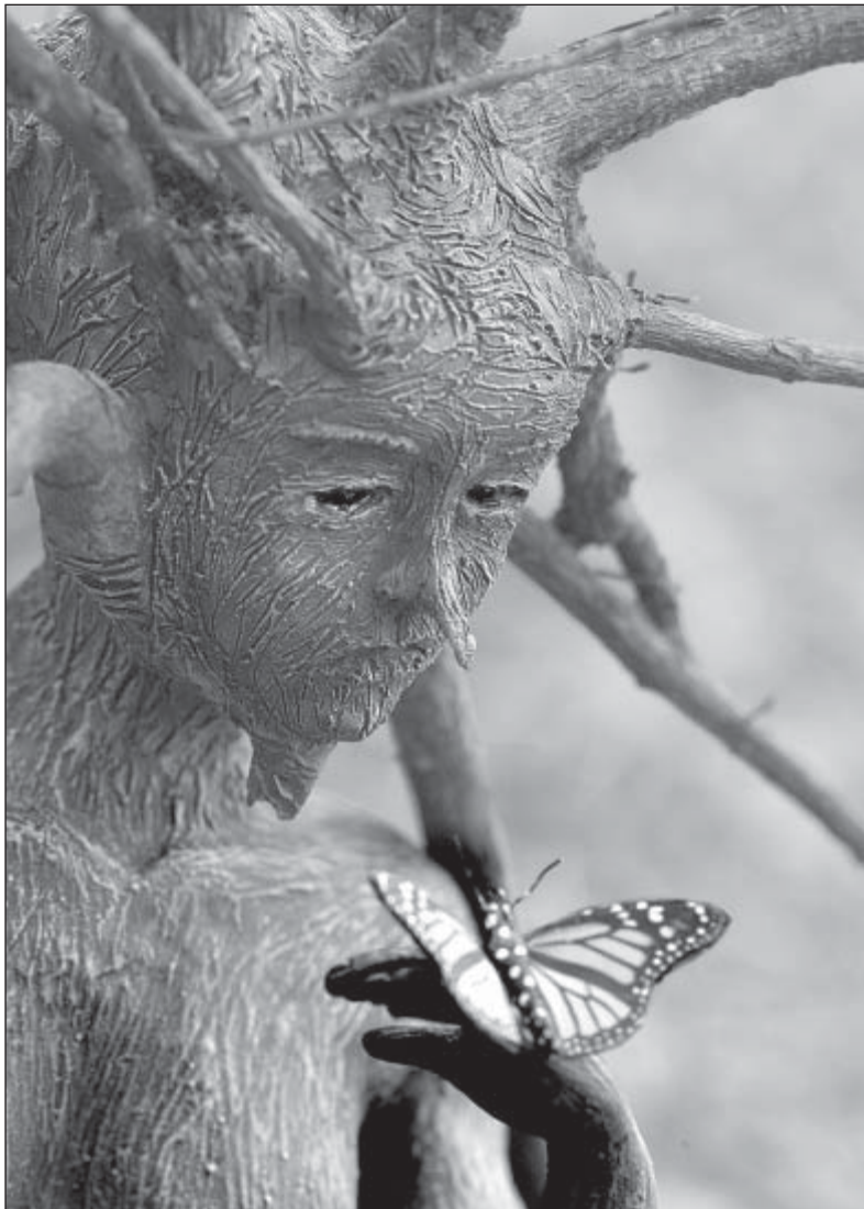
CONTEMPLATION – Sculpture by Sandra Highfield at Auburn Gallery.